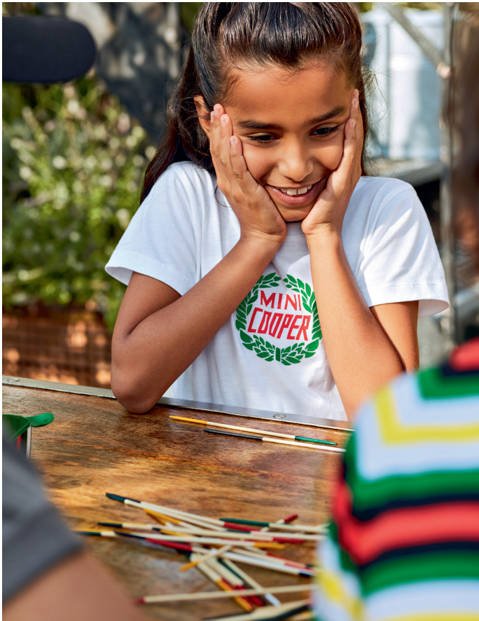
Left: Pick-Up Sticks, Vintage Logo T-Shirt Kids Right: Striped Lunch Box, Striped Sweatshirt Kids, Puzzle Set, Vintage Logo T-Shirt Kids