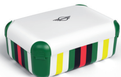
MINI STRIPED LUNCH BOX

Stoneware Multicoloured 80 28 2465939 7.6 × 7.6 × 10 cm Capacity: 0.35 l