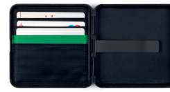
MINI HARD CASE WALLET

Multicoloured 80 27 2465936 5.5 × 9 × 0.4 cm