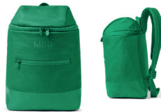
MINI TONAL COLOUR BLOCK BACKPACK

British Green 80 22 2463264 55 × 35.5 × 23 cm Capacity: 36 l volume