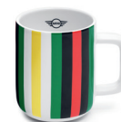
MINI STRIPED CUP

100% BPA-free polymer British Green 80 28 2465941 8 × 8 × 24.8 cm Capacity: 0.7 l