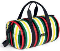
MINI STRIPED DUFFLE BAG

Material: 100% waxed cotton Lining: 100% polyester