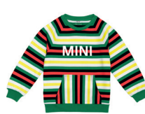
MINI STRIPED SWEATSHIRT KIDS