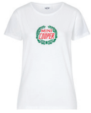
MINI VINTAGE LOGO T-SHIRT WOMEN'S