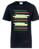
MINI STRIPE T-SHIRT MEN'S