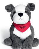
MINI BULLDOG 2.0

Plastics Multicoloured 80 45 2465957 5.5 × 5.5 × 0.8 cm