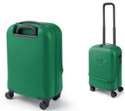
MINI CABIN TROLLEY

British Green 80 22 2463265 71 × 48.5 × 27.4 cm Capacity: 76 l volume