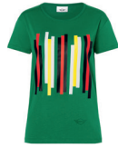
MINI STRIPE T-SHIRT WOMEN'S