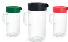
MINI COLOUR BLOCK ICE TEA JUG

100% BPA-free polymer British Green, Black, Coral 80 23 2465946-48 12.6 × 18.3 × 24.7 cm Capacity: 2 l