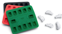
MINI ICE CUBE TRAYS

100% BPA-free polymer British Green, Black, Coral 80 28 2465943-45 8 × 8 × 19.4 cm Capacity: 0.7 l