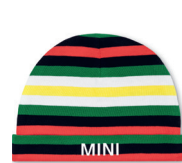
MINI STRIPED BABY GIFT SET

Beanie: 96% cotton, 4% elastane Socks: 80% cotton, 18% polyamide, 2% elastane