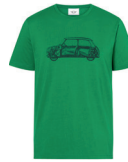
MINI CAR PRINT T-SHIRT MEN'S