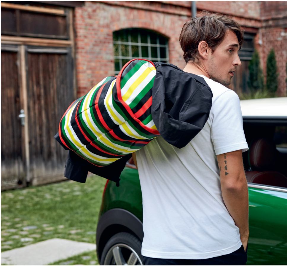
Left: Striped Duffel Bag, Two-Tone Jacket Men's Right: Striped Duffel Bag, Cabin Trolley, Bulldog 2.0, Striped Shopper, Striped Belt Bag, Tonal Colour Block Backpack