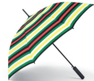
MINI STRIPED WALKING STICK UMBRELLA

Multicoloured 80 23 2465949 Folded: 27 × 6 cm Diameter: 98 cm Handle: 5 × 4 cm