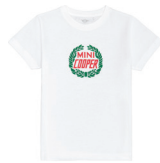
MINI VINTAGE LOGO T-SHIRT KIDS