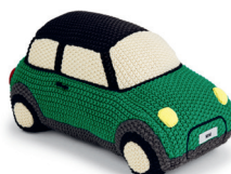
MINI KNITTED CAR

90% cotton, 10% polyester Grey/White 80 45 2465960 27 × 16 × 23 cm