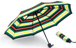
MINI STRIPED FOLDABLE UMBRELLA

British Green 80 21 2463263 8.5 × 8.5 × 0.4 cm