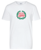
MINI VINTAGE LOGO T-SHIRT MEN'S

Black/British Green XXS–XL 80 14 2463206–11