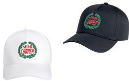
MINI VINTAGE LOGO CAP

Black/British Green S–XXXL 80 14 2463236–41