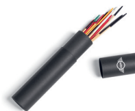
MINI PICK-UP STICKS

Puzzles: cardboard Bags: 100% cotton Multicoloured 80 45 2465956 Each puzzle: 36 × 26 cm