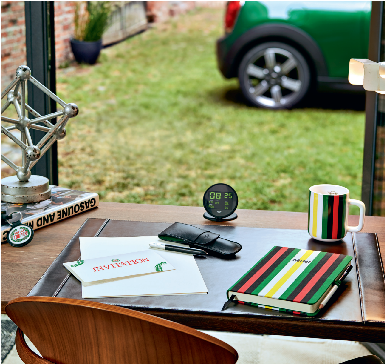
Vintage Logo Keyring, Leather Pencil Case, Alarm Clock, Striped Notebook, Striped Cup