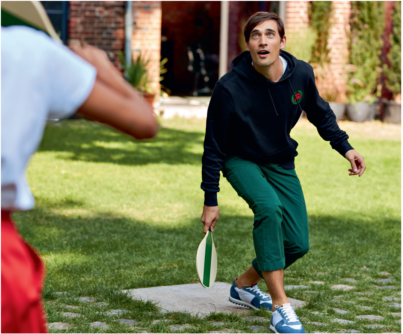
Left: Beach Tennis, Vintage Logo Sweatshirt Men's Right: Football, Stripe T-Shirt Men's