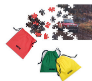
MINI PUZZLE SET

Ball: PVC Mesh backpack: 100% polyester White/British Green/Black 80 45 2465955 Circumference: 68 cm