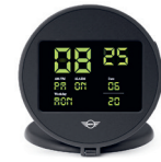
MINI ALARM CLOCK

Black 80 21 2463257 10.5 × 10.5 × 2.2 cm