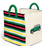
MINI STRIPED TOYBOX

95% cotton, 3% polyester, 2% viscose British Green 80 45 2465958 26 × 14 × 13 cm