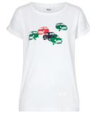
MINI CAR PRINT T-SHIRT WOMEN'S