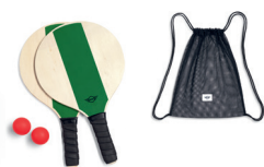
MINI BEACH TENNIS

Polypropylene Multicoloured 80 28 2465940 16 × 11 × 6 cm